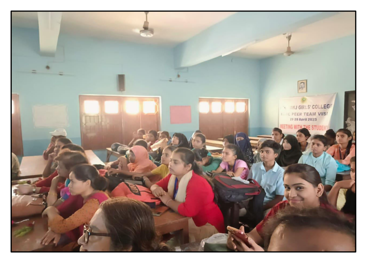
Students and teachers attending the lecture